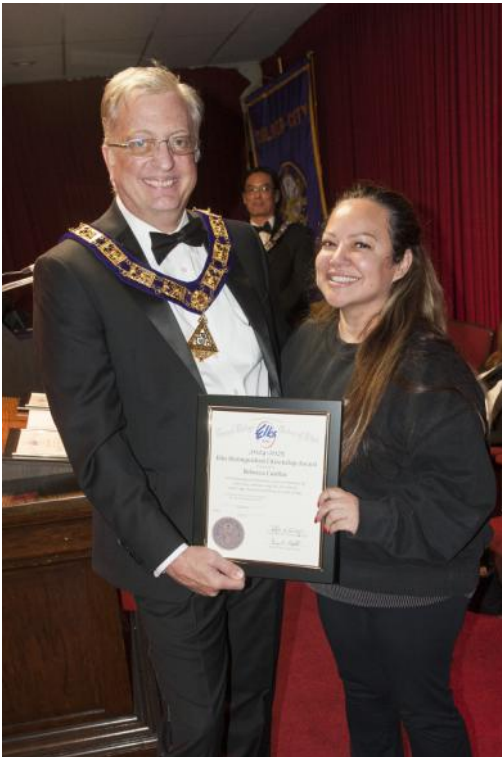
Elk of the Year