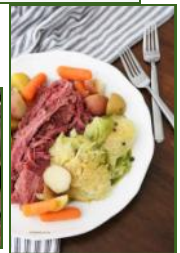
Corned Beef & Cabbage