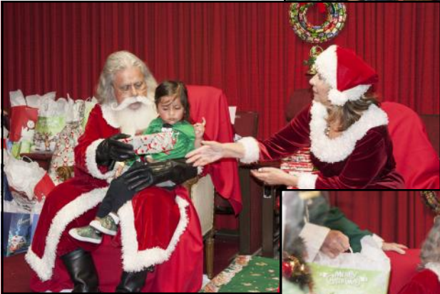
SANTA'S ENTRANCE AND GIFT GIVING