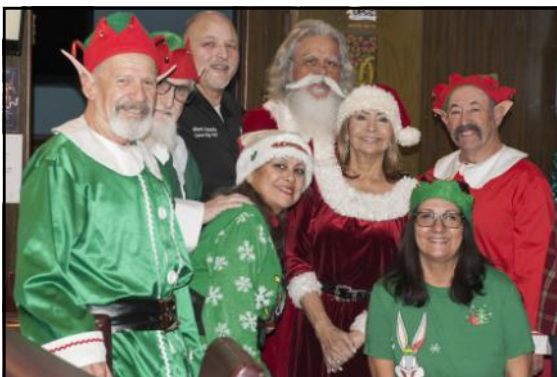
SANTA AND HIS ELVES