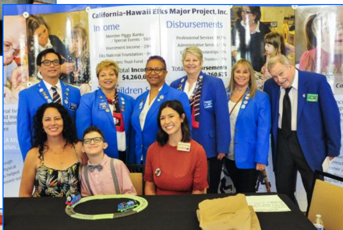
(Above) The district ER's meet the 2023 CHEMPI Theme Child