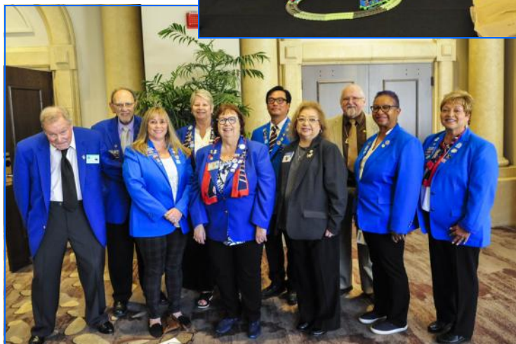
(Left) ER's and District officers pose outside of the main meeting hall.